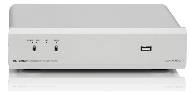
Perfect Companion: MX-Stream with MX-DAC